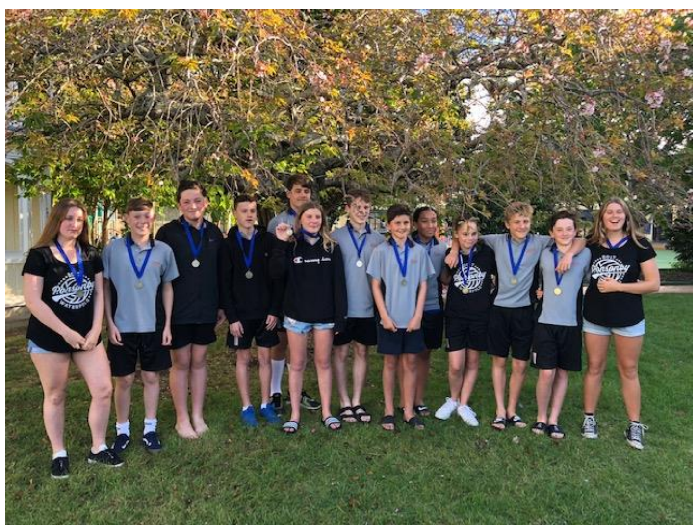
North Islands Tournament team - Sharks, 2<sup>nd</sup> Place in B grade